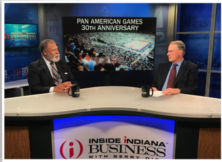
EAI provides the RIGHT Media positioning.

Transforming Elite Athletes & Top Executives into Industry-Leading Experts through Proven Strategies and Done-For-You Solutions.