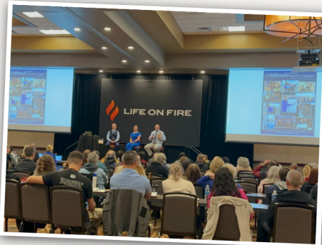
EAI Provides the RIGHT speaker coaching.

LEADERS AGREE that EAI has the experience and knowledge to collapse time and create success!