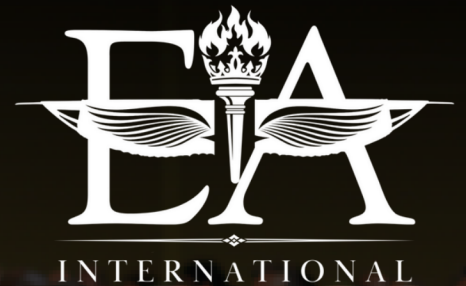
EAI provides the RIGHT level of professional support.